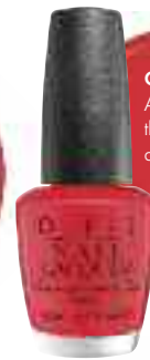
OPI on Collins Ave. A sizzling red-orange that knows where the action is.