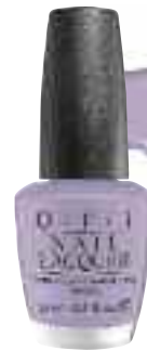
Done Out in Deco A "deco"-dent shade of arty lilac

Shades that capture the colour, the fashion, and the trend-setting excitement of the world's most stylish celeb playground!