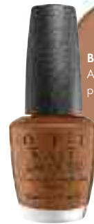
Bronzed to Perfection A toasty brown that's perfectly sexy.