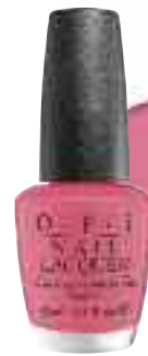
Feelin' Hot-Hot-Hot! A flamingo pink blazing with style.