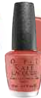
Conga-Line Coral A hip-shaking, fiery, orange-rose.