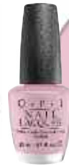
Suzi & the Lifeguard A not-so-innocent light pink.