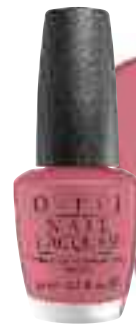
Party in My Cabana Wear your cutest bikini and this rich, "cab"-ivating pink!