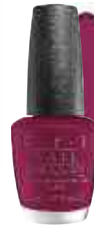
Miami Beet This racy red-violet could be your vice.