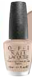
Sand in My Suit Can you "bare" this nude shade?