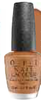
Clubbing til Sunrise A golden tangerine that goes from dusk to dawn.