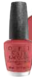
Paint My Mojitoes Red A warm rosy red for cocktails on the beach.